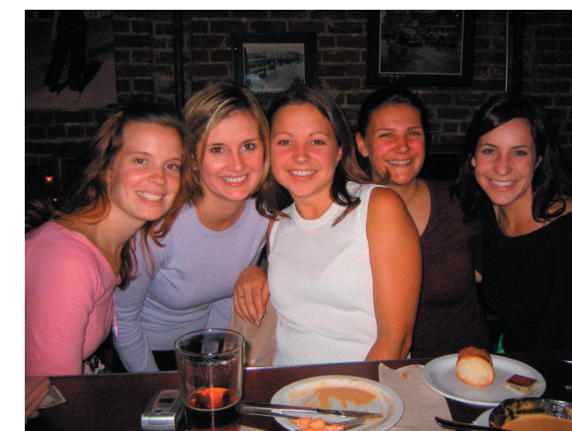
DG Alumnae Happy Hour at ChaChaCha

Panhellenic Badge Day is March 6. As one of the National Panhellenic Conference's seven founding fraternities, Delta Gamma holds an important place in the history of women's fraternities. This year's theme is "Remember Your Pledge of Loyalty... Wear Your Badge with Pride." I challenge you all to wear your badge or letters. Delta Gammas are our neighbors and co-workers. They are women we pass on the sidewalk everyday. Wear your badge and meet a new DG. You never know who might be your sister!