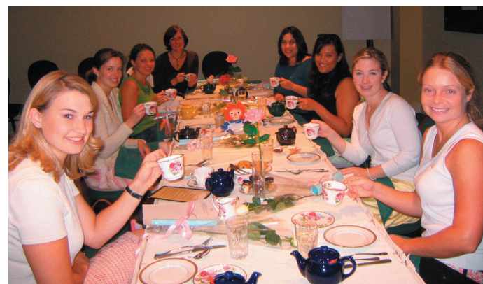
DG Alumnae Tea at King George Hotel

And finally, our Dock at Dolce event was a huge success raising money for the Guide Dogs for the Blind in San Rafael. If you love dogs as much as I do, you won't want to miss graduation day for these pups! We'll keep you updated on dates and times.